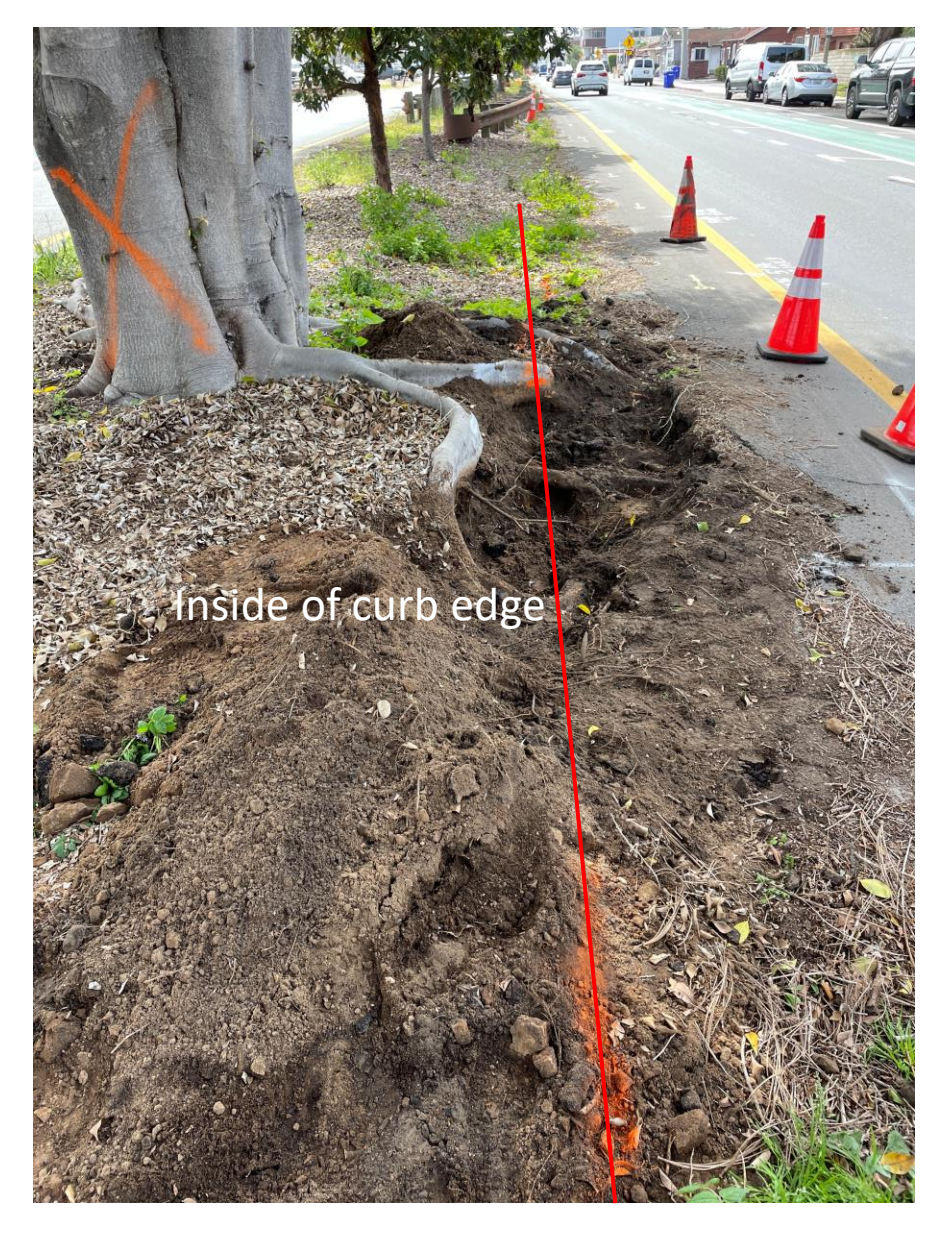
<u>25735ETree</u>: Detail view of root excavation down to approx. 6 inches below finished grade