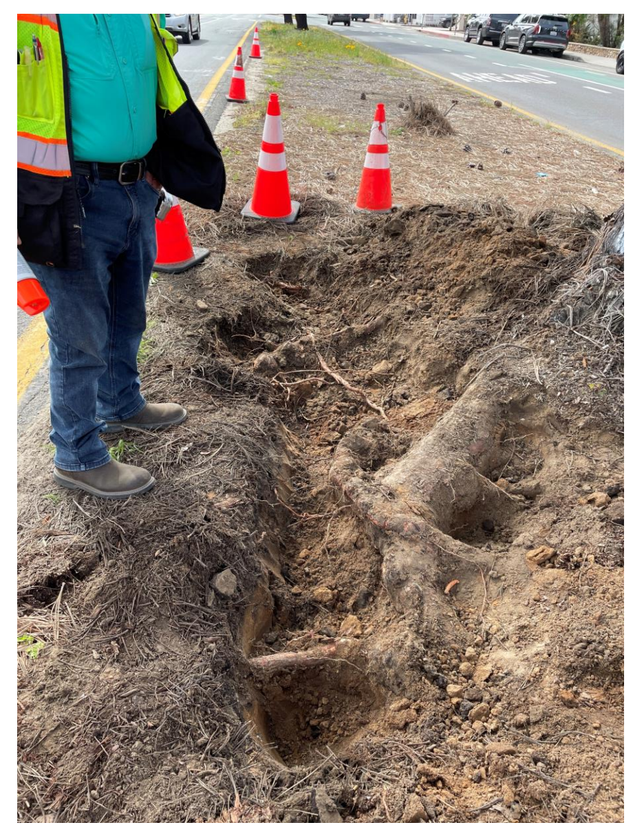
<u>25753ETree</u>: Detail view of root excavation down to 6 inches below finished grade