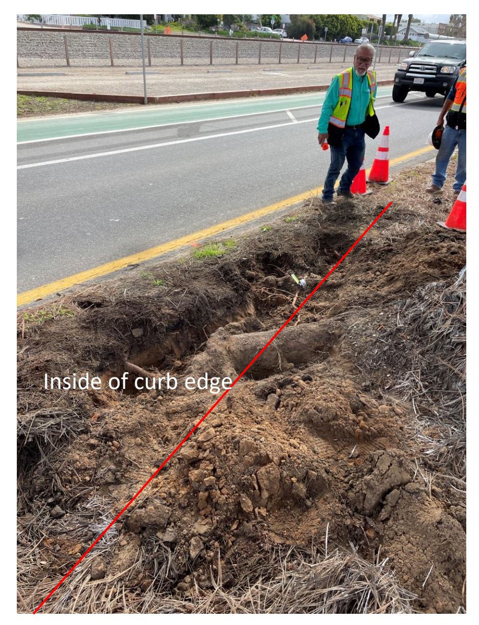
<u>25753ETree</u>: Detail view of root excavation down to 6 inches below finished grade