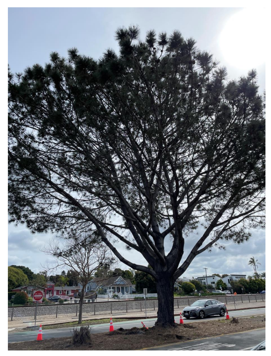
<u>25753ETree</u> - Removal