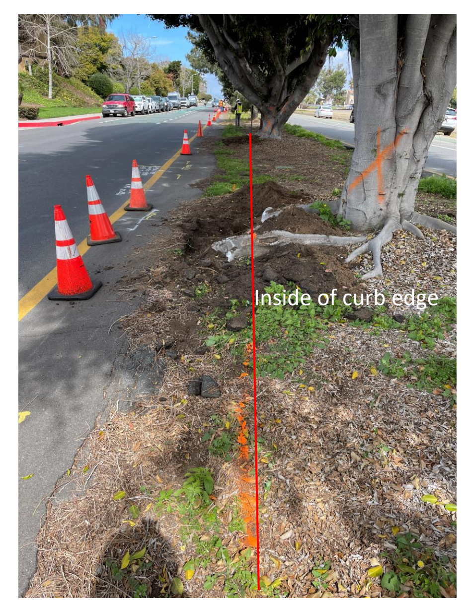
<u>25735ETree</u>: Detail view of root excavation down to approx. 6 inches below finished grade