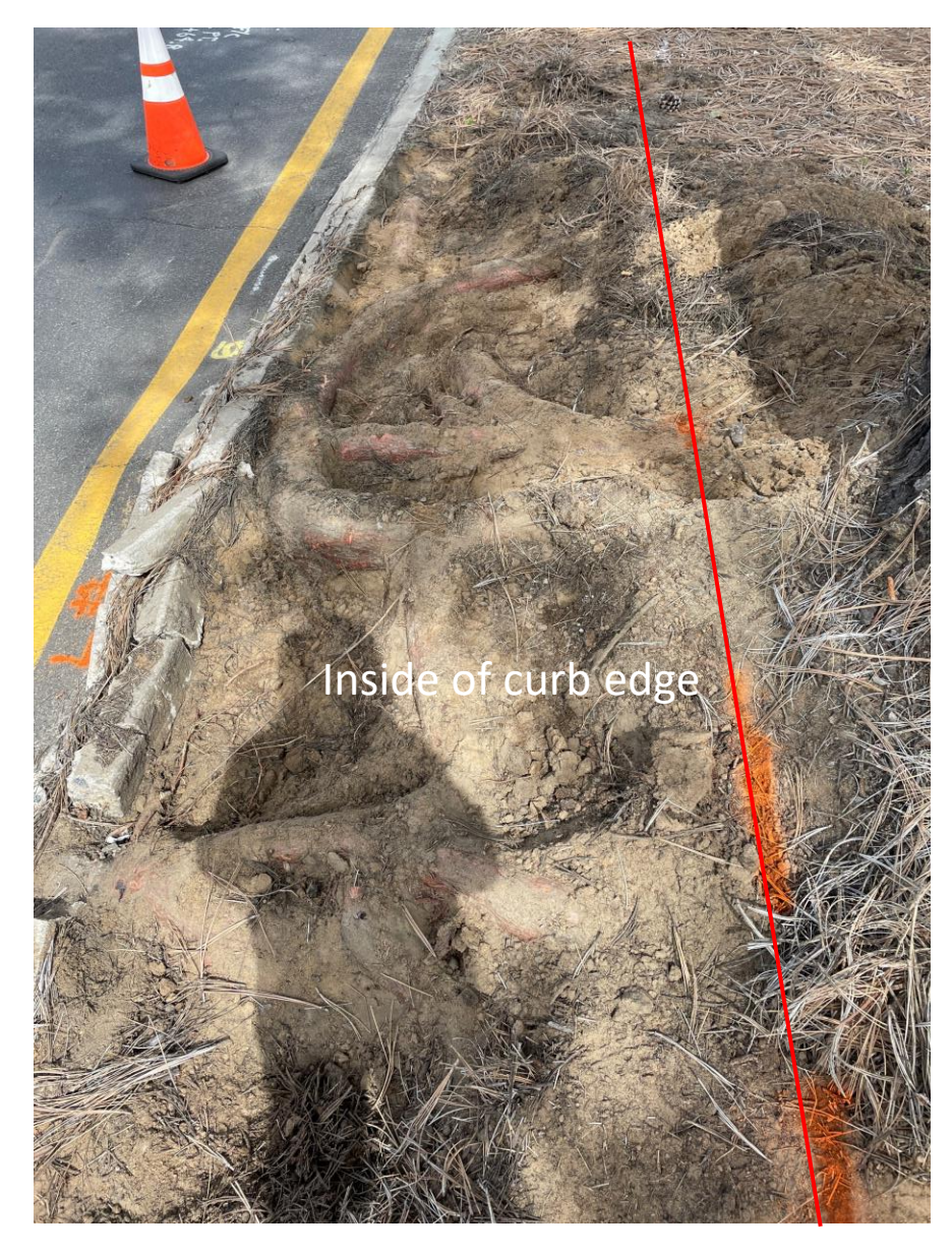
<u>25725ETree</u>: Detail view of root excavation down to approx. 6 inches below finished grade