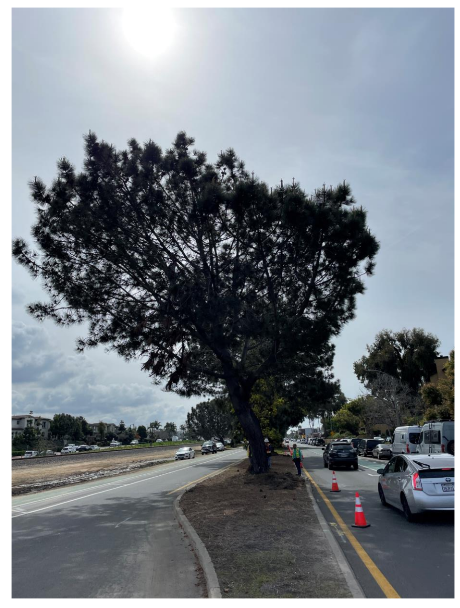
25725ETree - Removal