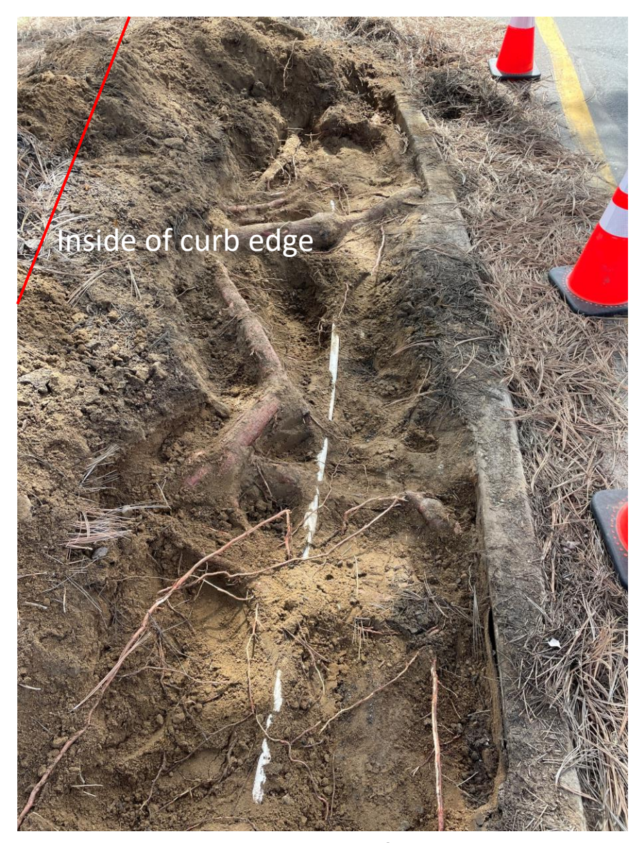
<u>25729ETree</u>: Detail view of root excavation down to 6 inches below finished grade