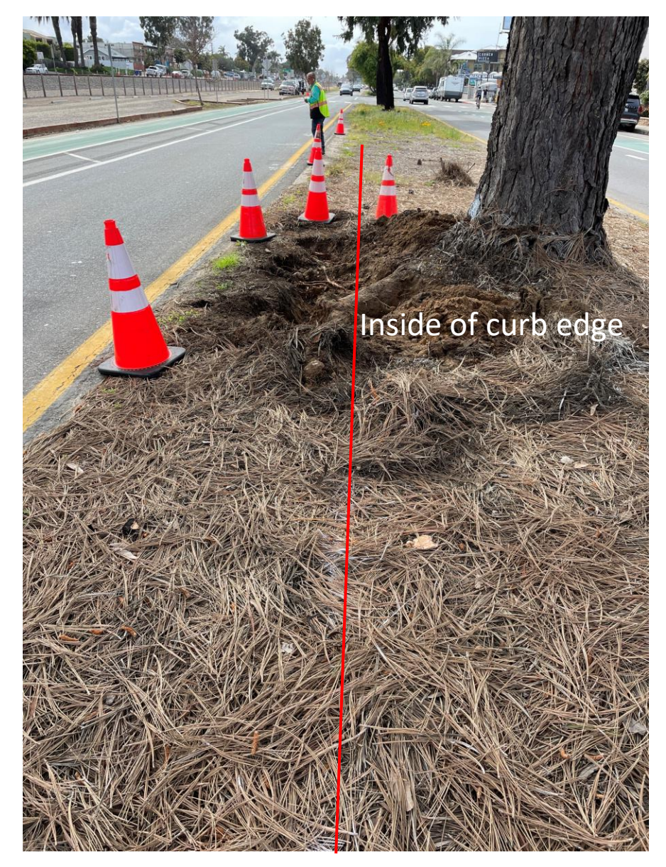
<u>25753ETree</u>: Detail view of root excavation down to 6 inches below finished grade