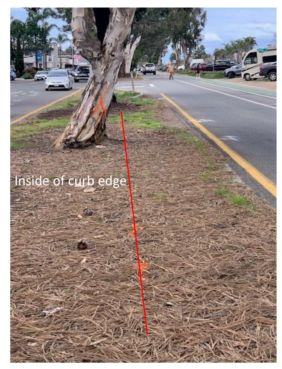
<u>25705ETree</u>: Detail view of proposed curb in proximity to tree trunk