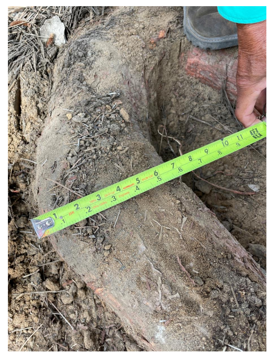
<u>25725ETree</u>: Detail view of large structural root