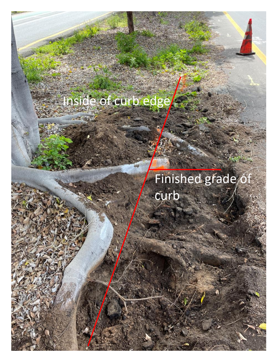
<u>25735ETree</u>: Detail view of root excavation down to approx. 6 inches below finished grade