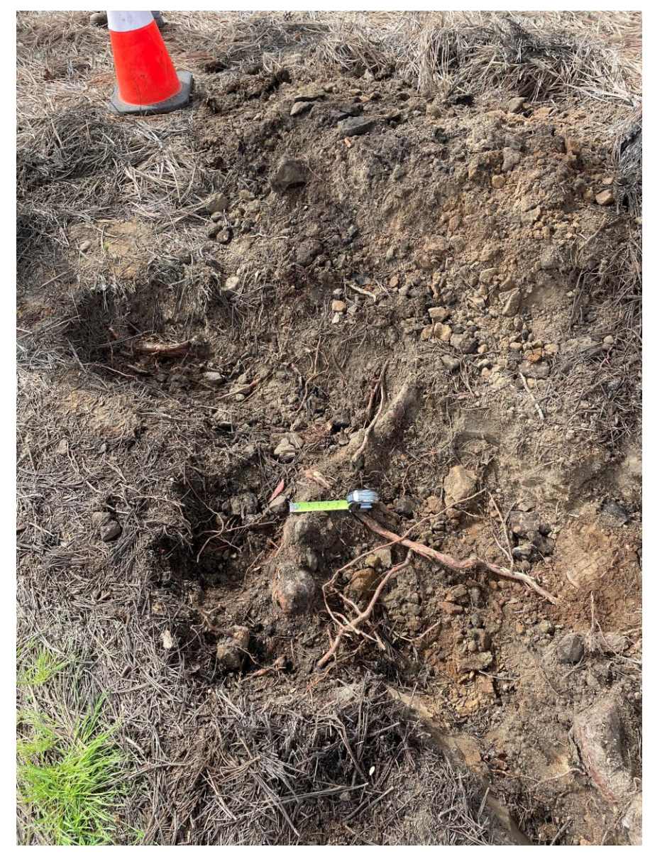
<u>25753ETree</u>: Detail view of large structural root