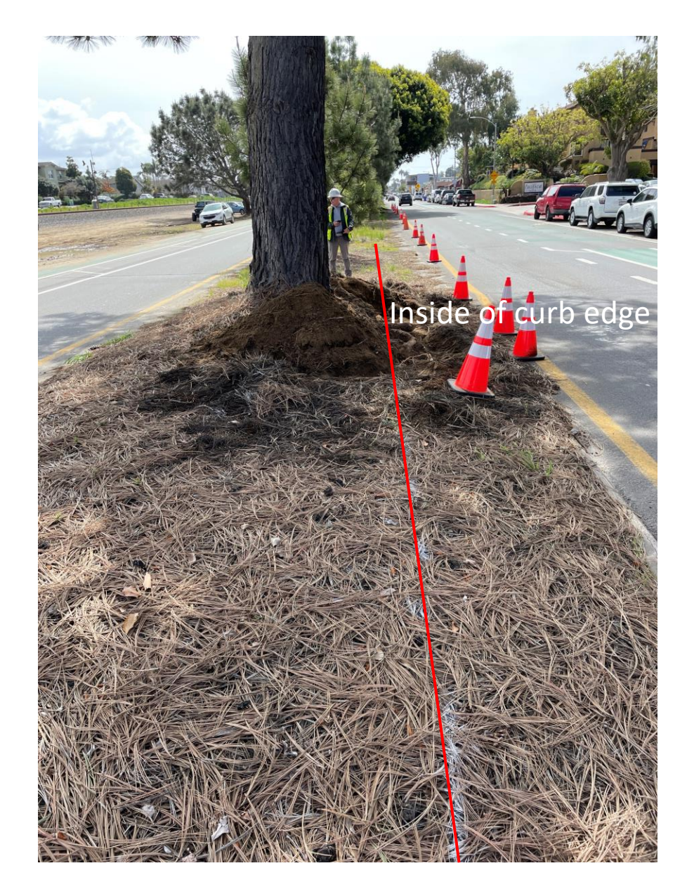
<u>25729ETree</u>: Detail view of root excavation