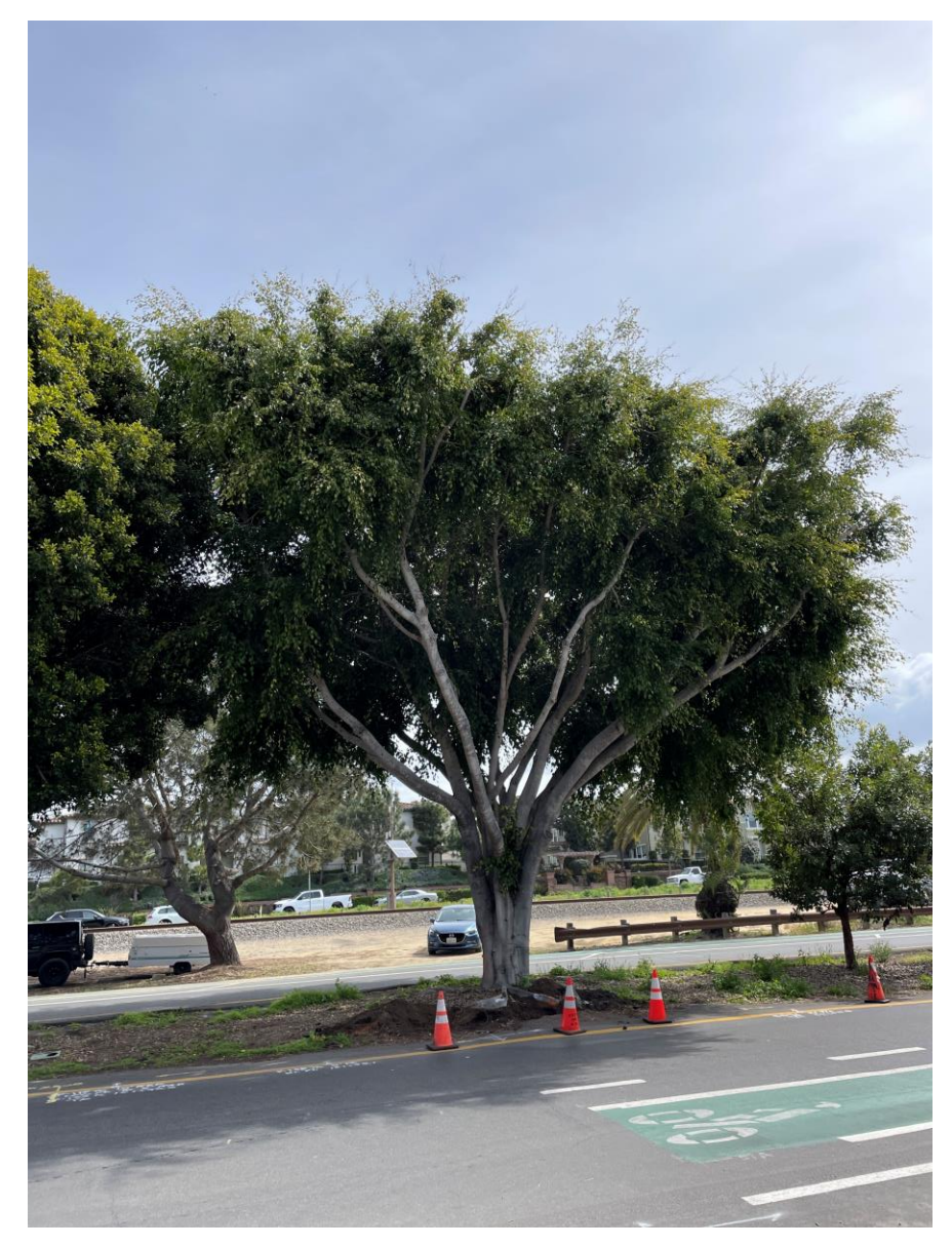
<u>25735ETree</u> - Removal