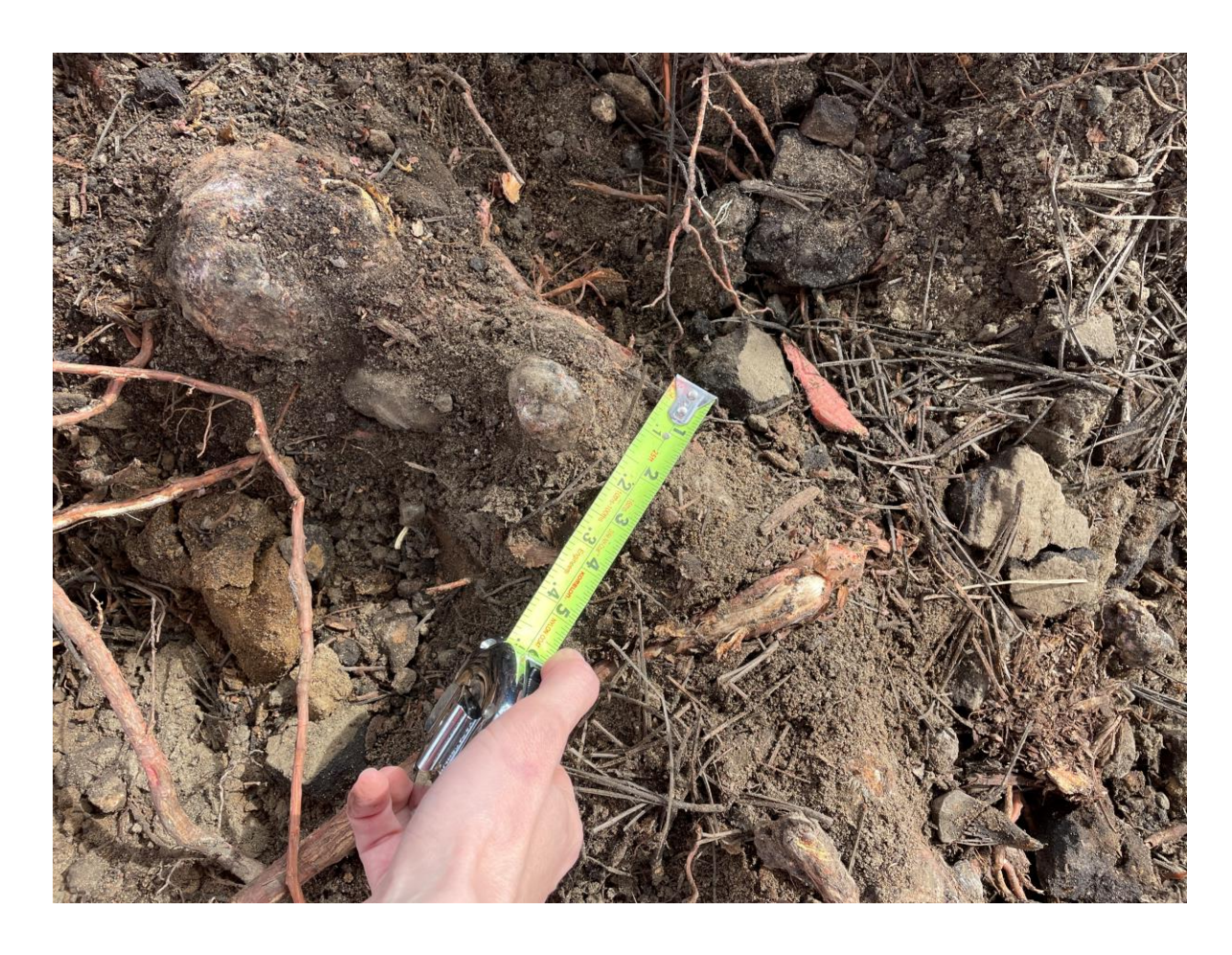
<u>25753ETree</u>: Detail view of large structural root