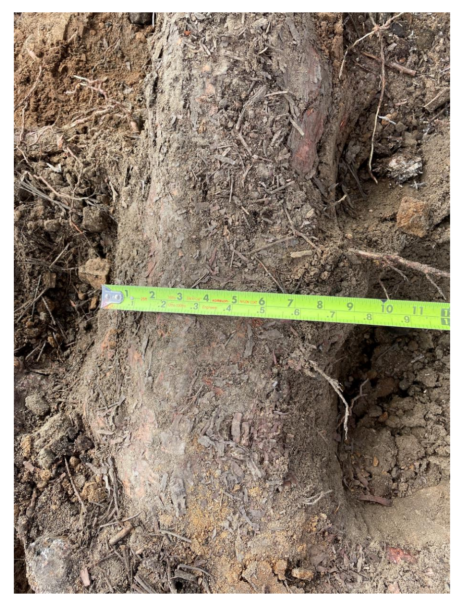
<u>25753ETree</u>: Detail view of large structural root