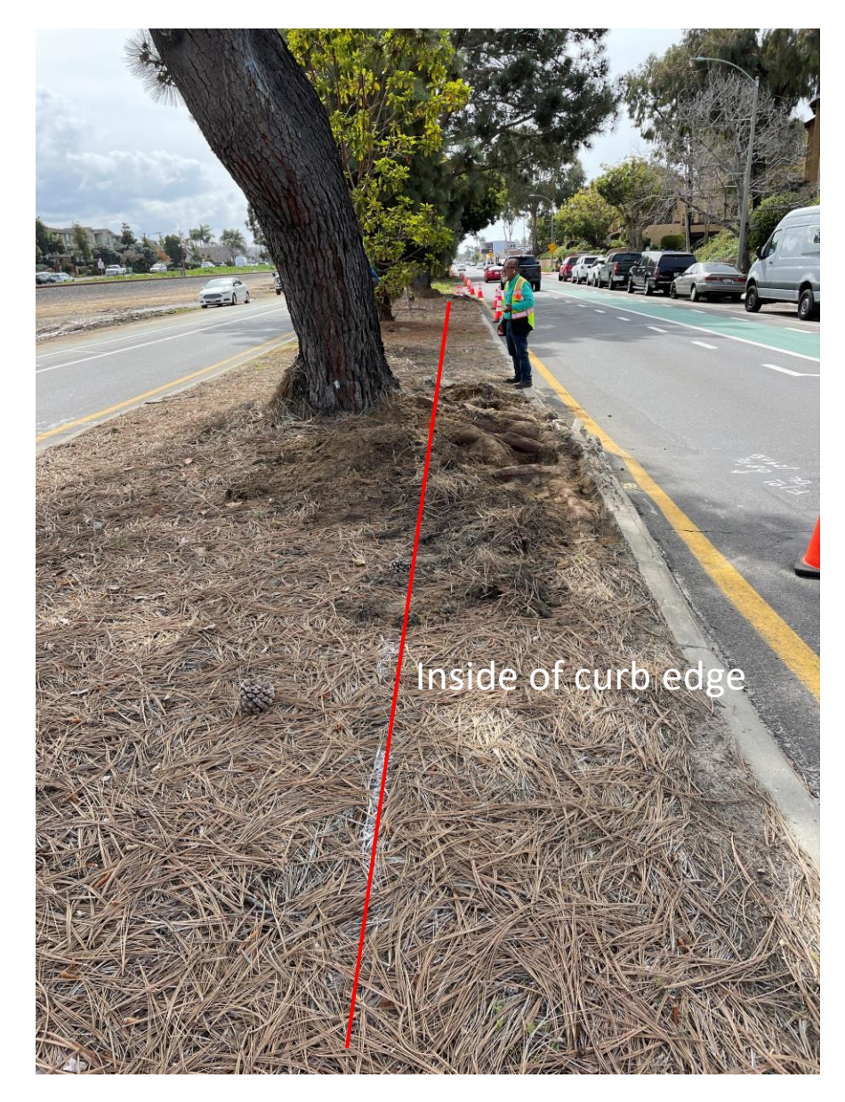
<u>25725ETree</u>: Detail view of root excavation down to approx. 6 inches below finished grade