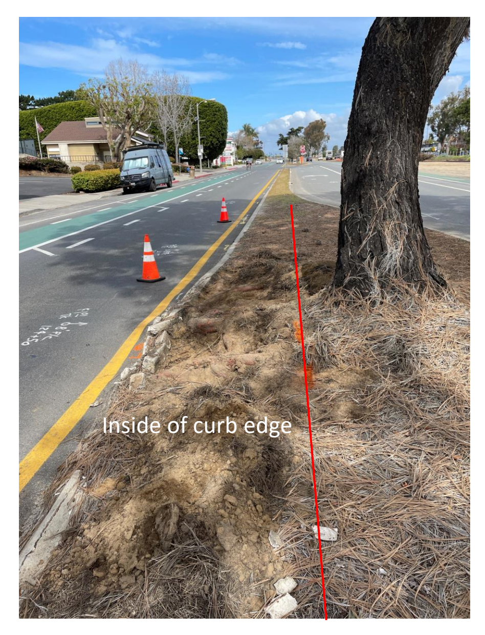
<u>25725ETree</u>: Detail view of root excavation down to approx. 6 inches below finished grade