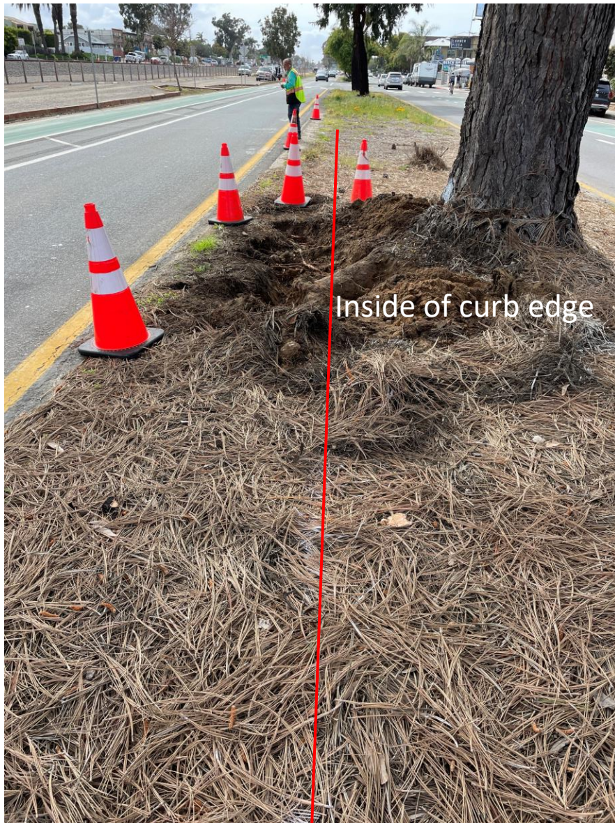
25601ETree : Detail view of root excavation down to 6 inches below finished grade