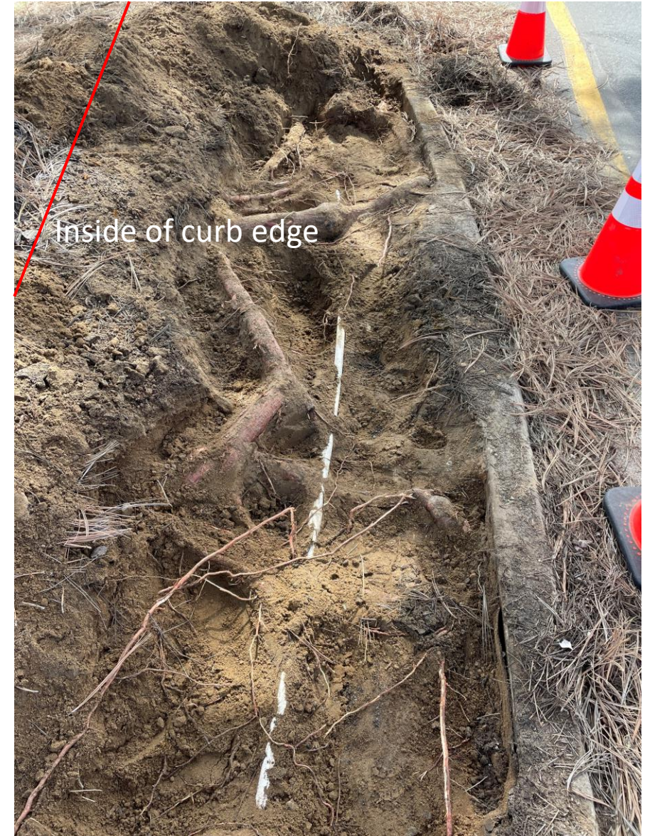
25729E Tree: Detail view of root excavation down to 6 inches below finished grade