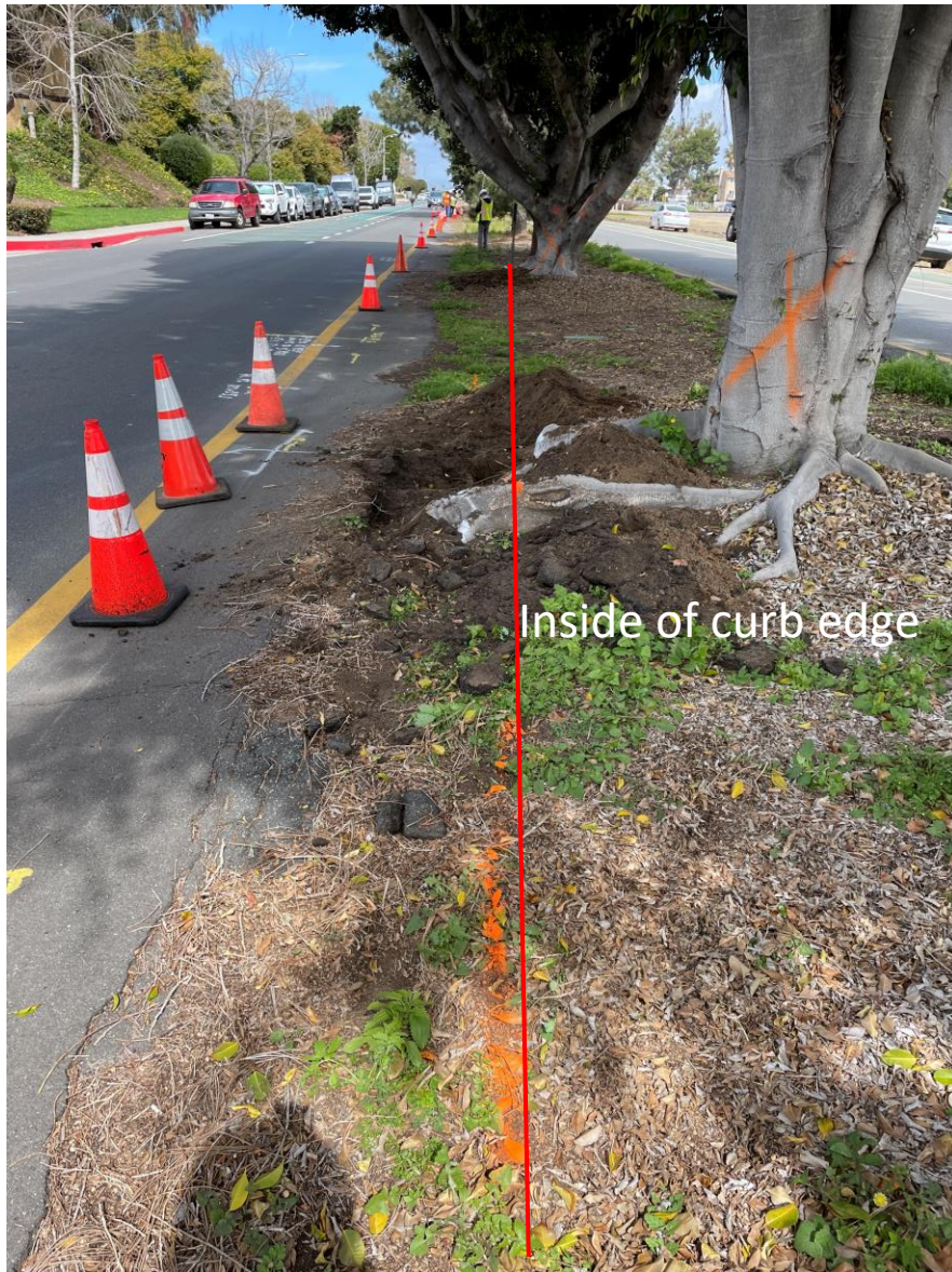
25735E Tree: Detail view of root excavation down to approx. 6 inches below finished grade