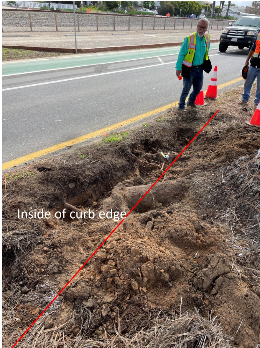
25601ETree : Detail view of root excavation down to 6 inches below finished grade