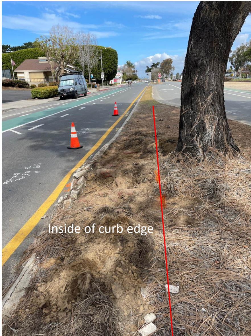
25725E Tree: Detail view of root excavation down to approx. 6 inches below finished grade