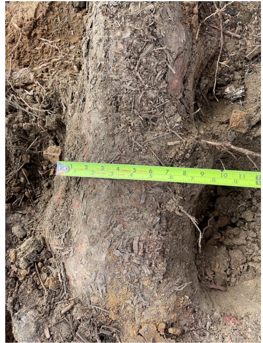
25601ETree : Detail view of large structural root