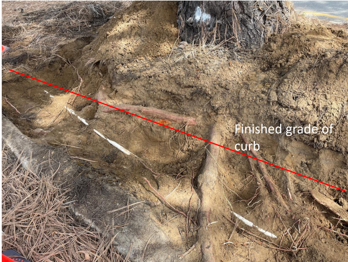
25729ETree : Detail view of root excavation down to 6 inches (+) below finished grade