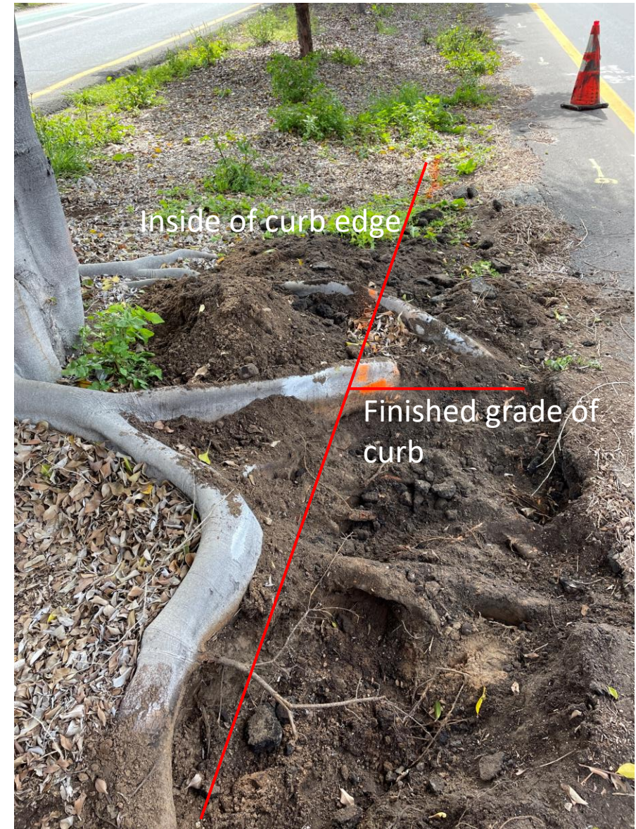
25735E Tree: Detail view of root excavation down to approx. 6 inches below finished grade