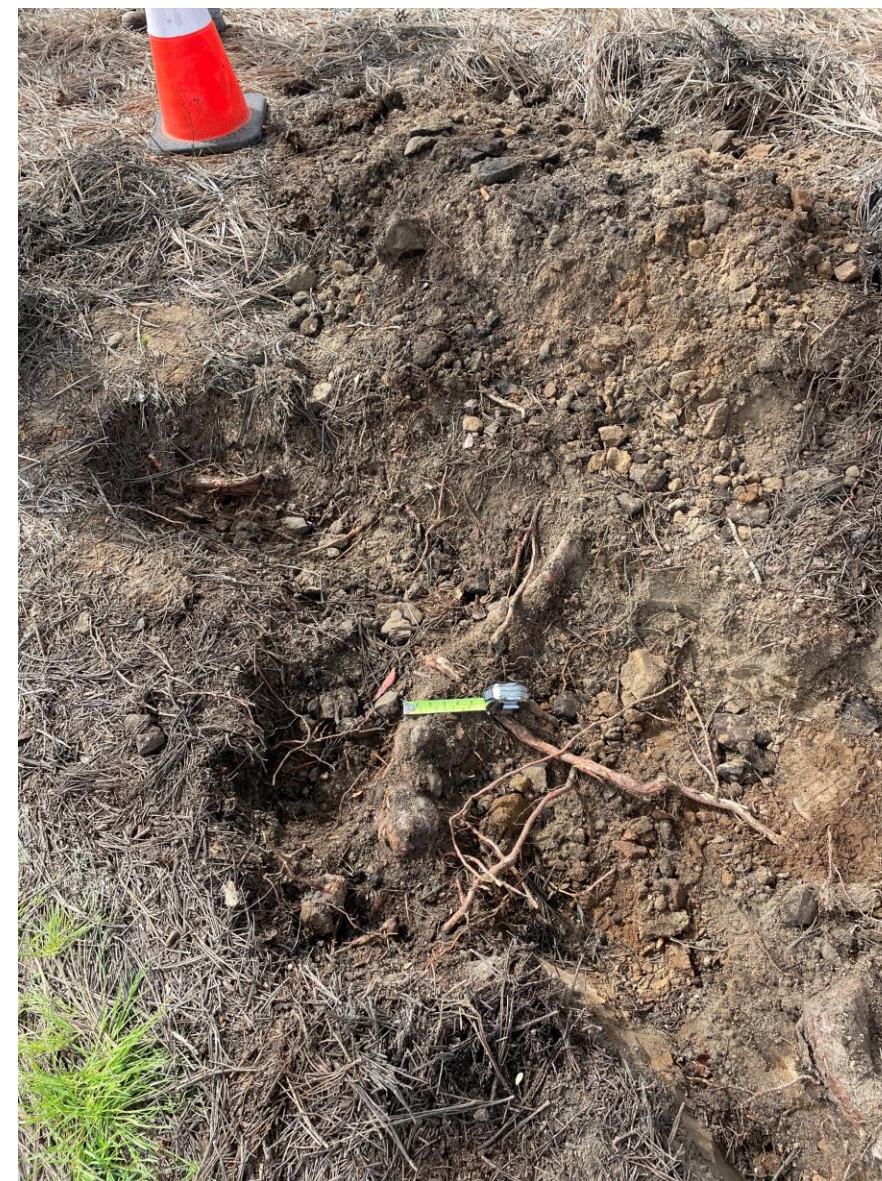
25601ETree : Detail view of large structural root