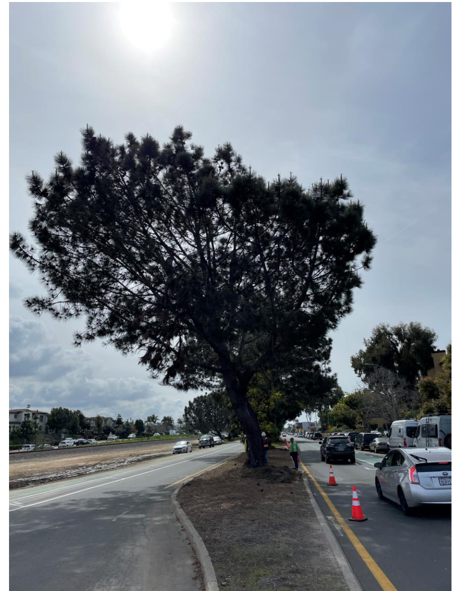
25725ETree - Removal