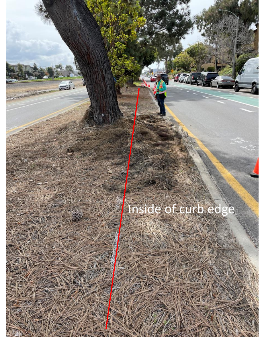
25725ETree : Detail view of root excavation down to approx. 6 inches below finished grade