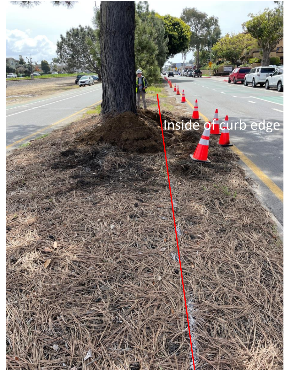
25729ETree : Detail view of root excavation