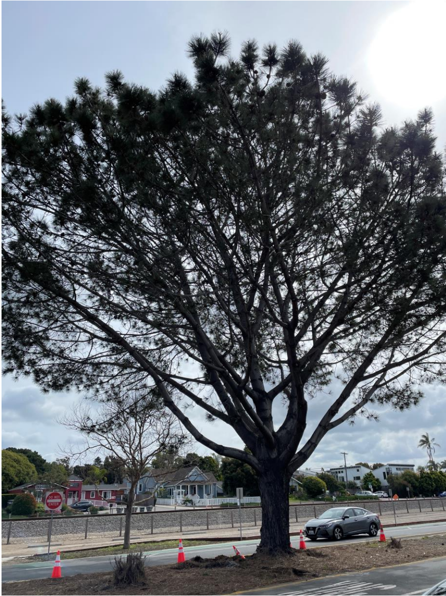
25601ETree - Removal