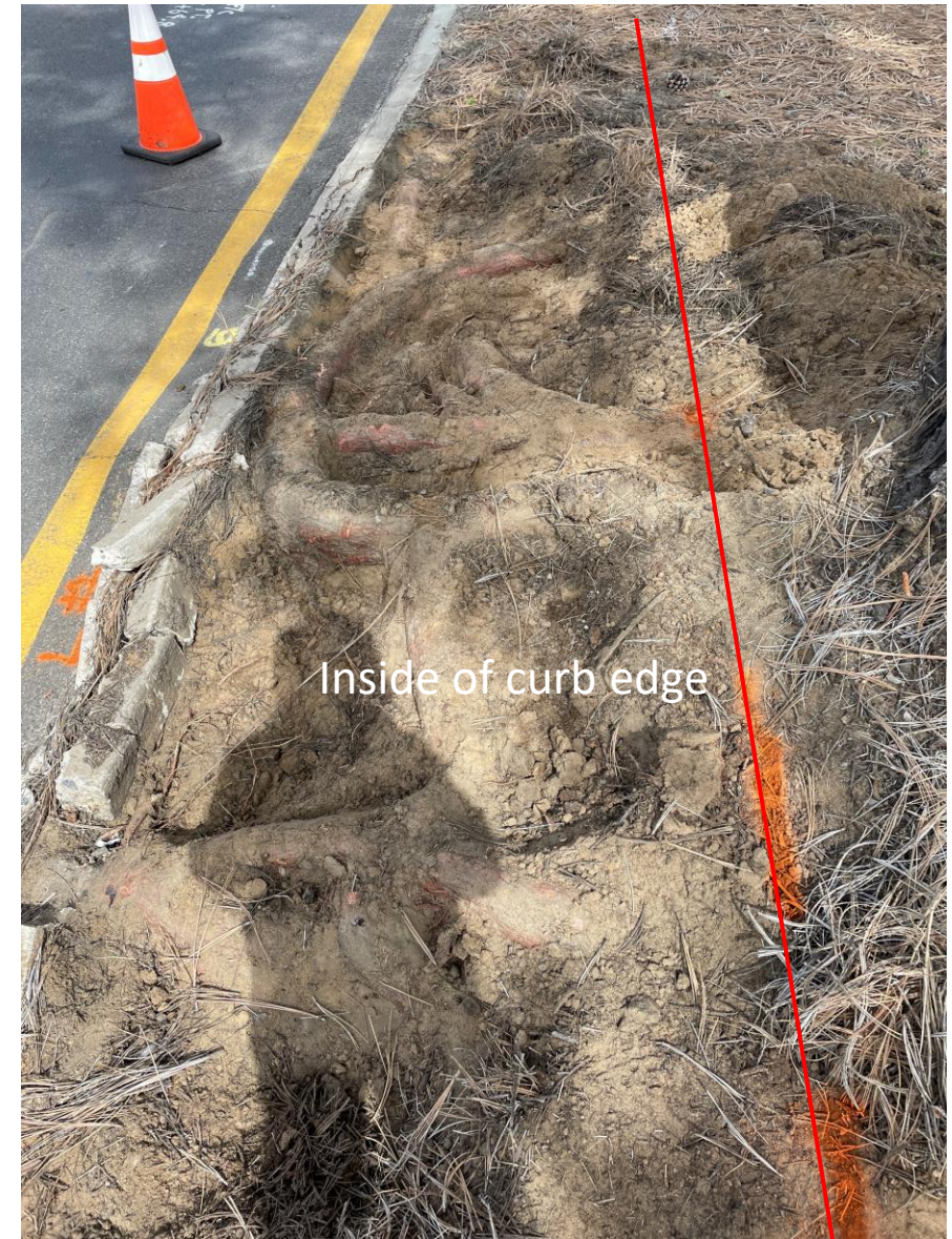
25725E Tree: Detail view of root excavation down to approx. 6 inches below finished grade