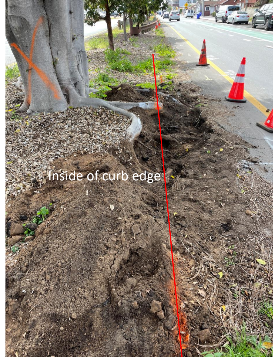
25735E Tree: Detail view of root excavation down to approx. 6 inches below finished grade