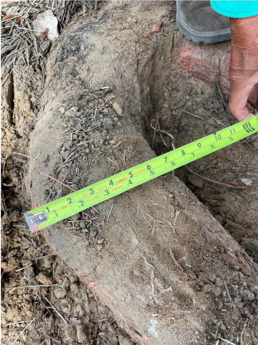
25725ETree : Detail view of large structural root