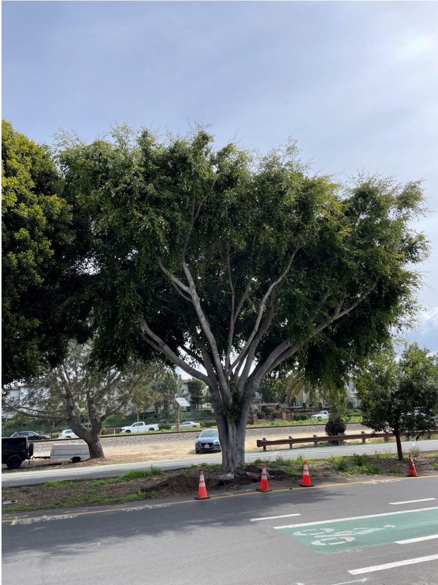
25735E Tree - Removal