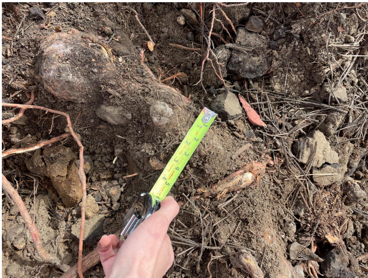
25601ETree : Detail view of large structural root