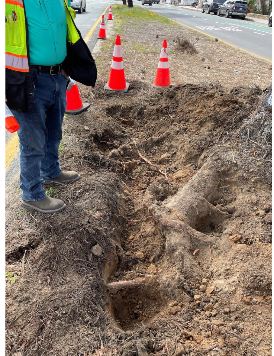
25601ETree : Detail view of root excavation down to 6 inches below finished grade