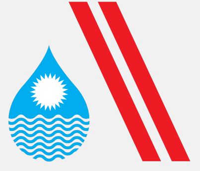
San Dieguito Water District

customers will receive results. Register HERE.