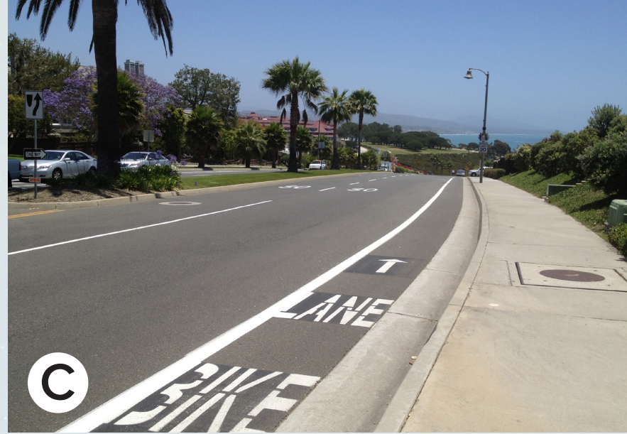
Standard Bike Lane