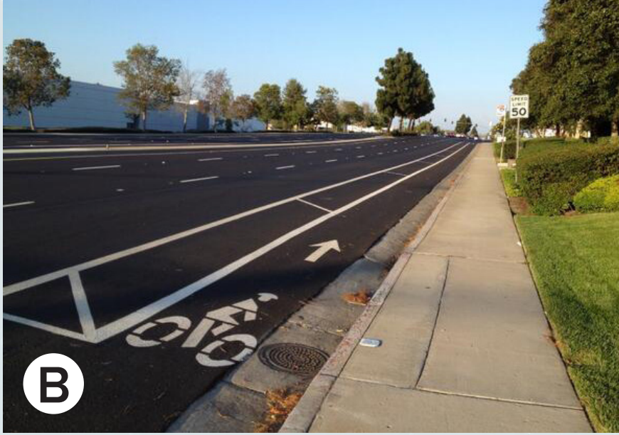
Buffered Bike Lane