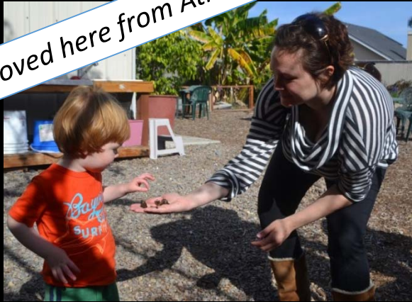
Moved here from Atlanta