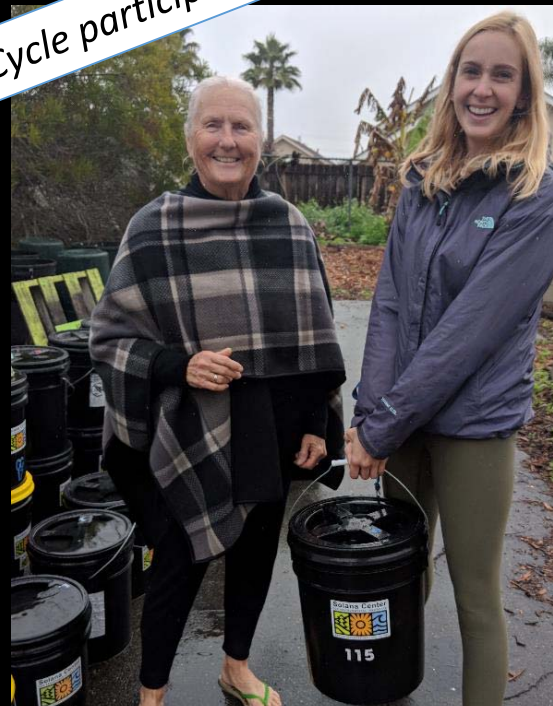
Food Cycle participant